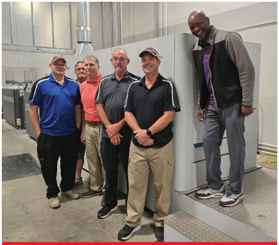
The entire ES&S team has enthusiastically embraced the technology innovations built into the ColorStream 6900.