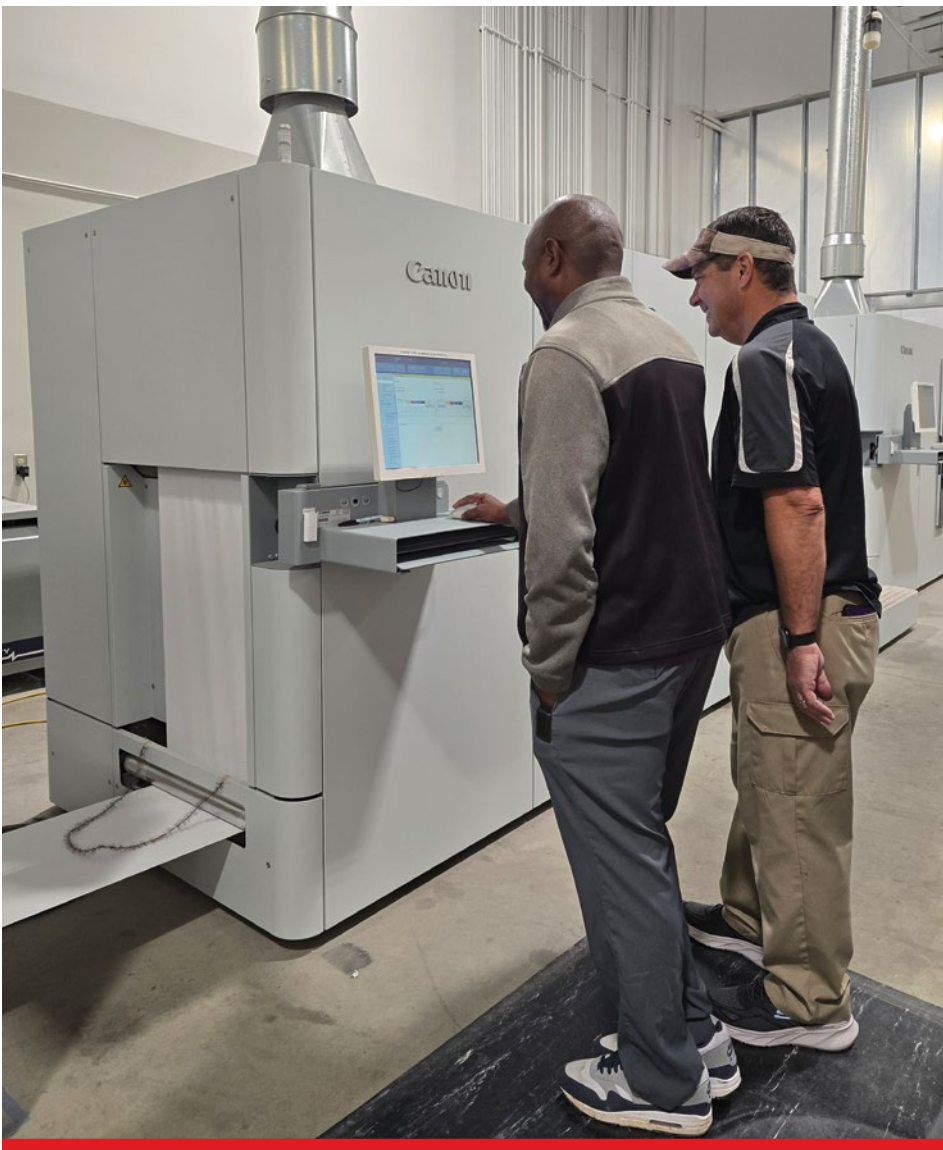
Custom integrated workflow built by Canon helps ES&S manage and fulfill Alabama's election print needs.