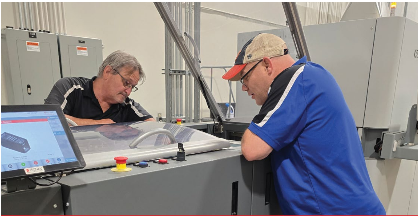
Technicians at ES&S inspect output from the Canon ColorStream web-fed inkjet press.

The production process she describes relied heavily on manual work. Ballot jobs—usually involving multiple precincts—were provided as PDFs, along with spreadsheets containing the job details, including information such as ballot lengths and quantity breakdown by precinct. The PDF files were manually separated and imposed four-up, with similar quantities ganged together for platemaking and printing. Each job also required time- and labor-intensive postpress steps such as numbering, perforating, offset stacking, and stapling or hand-stitching into pads.