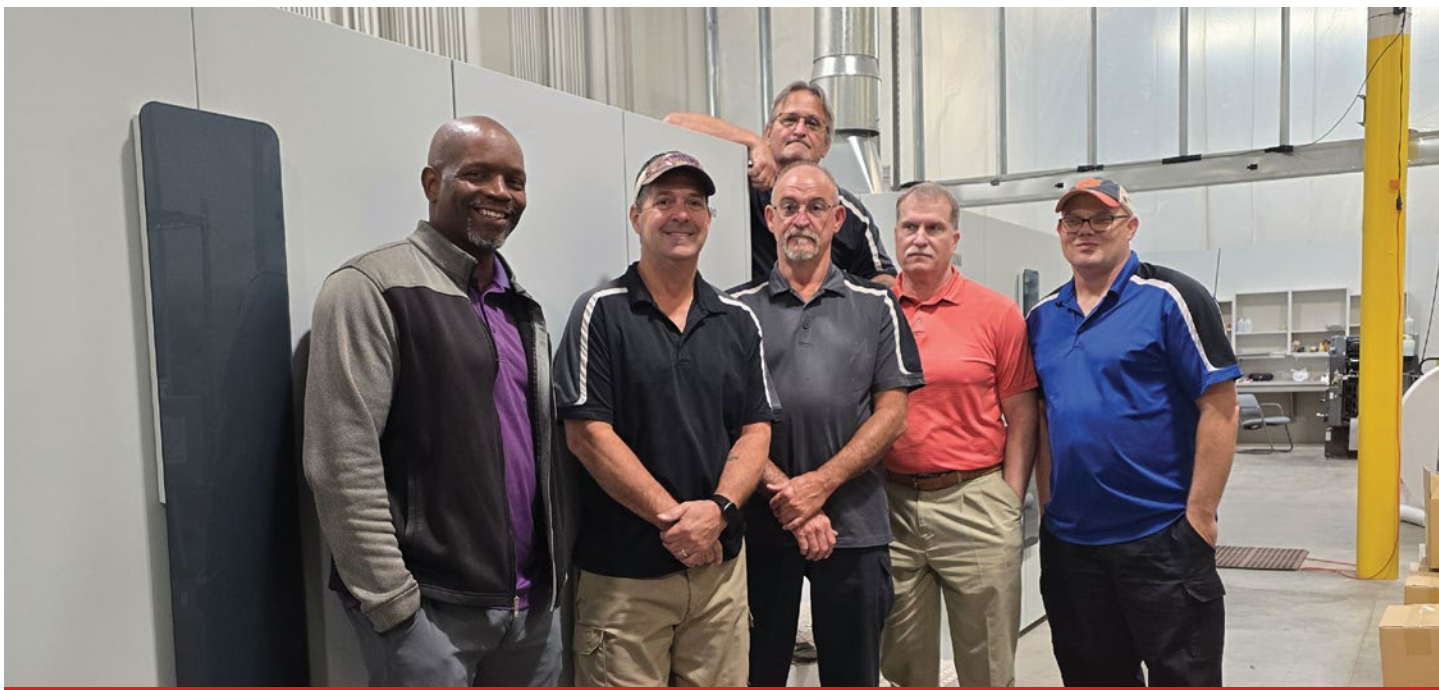
Print Production Team at ES&S in their Alabama facility with the Canon ColorStream web-fed inkjet press.

print job at ES&S. The county may have 18 different ballot styles, with different quantities needed for all those styles. What color ink? One-sided or two? Numbered or not? Maybe we need a perforation at one-and-a-half-inch intervals along a 17-inch-long ballot. And it has to be offset stacked and stapled in pads of 50."