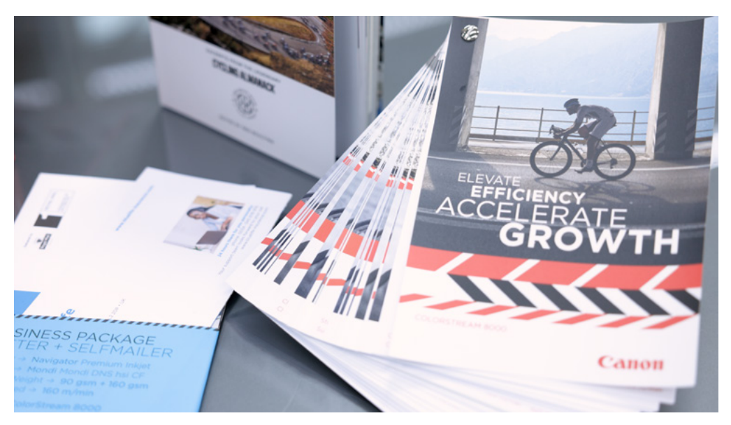
The ColorStream 8000 represents the next stage in the evolution of the press family and is designed to elevate efficiency and accelerate growth.