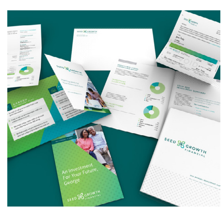
The ColorStream 8000 can print a broad variety of applications from brochures to booklets to transactional materials.

Jansen also points out that carrying through each generation of the ColorStream is Canon's more than 40 years of experience in developing production digital presses and its commitment to integrating customer requests in product development. Another validation point of Canon's commitment to innovation is that for 36 years, it has ranked in the top five for the number of U.S. Patents issued<sup>2</sup>.