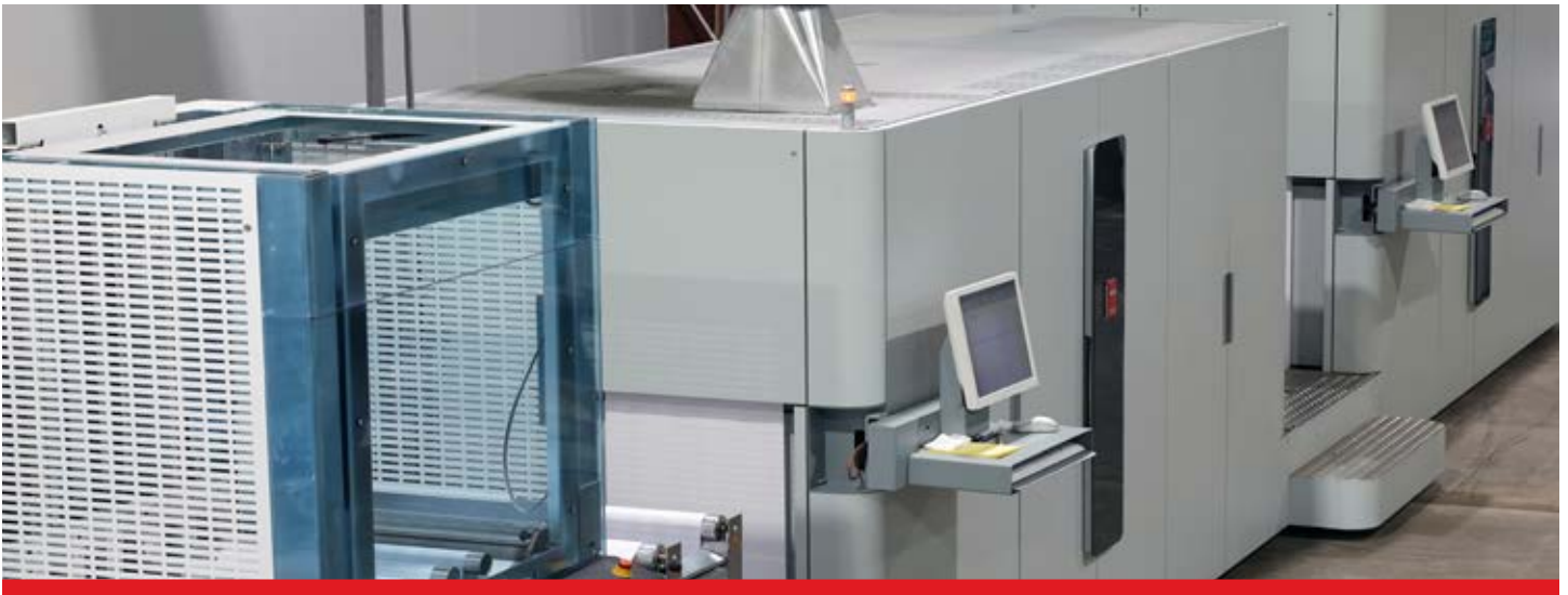
When SDI Innovations upgraded to the Canon ColorStream 6900, the jump in productivity, quality, and reliability catalyzed the company's expansion and diversification into new markets.

issue with the finishing equipment. "Our production runs do not go down often, and if they do, it's typically the finishing equipment that's causing the issue, not the inkjet press."