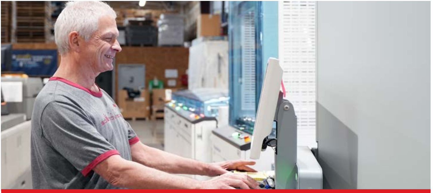
Canon's PRISMA production workflow solution and ColorStream 6900 web-fed inkjet press have enabled the SDI Innovations team to expand the company's production schedule to include millions of additional impressions per year.

as demonstrated by sponsoring the THINK inkjet user community to offering the industry its "Print Is Life" promotional campaign materials and supporting several advisory boards that solicit recommendations and industry knowledge from both customers and noncustomers.