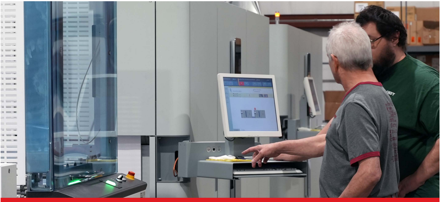
Canon's PRISMA production software lets the SDI Innovations team automate a prioritized production roster that can be easily revised to accommodate last-minute demands or short-run projects.

books, and a homeschooling program could order even fewer.