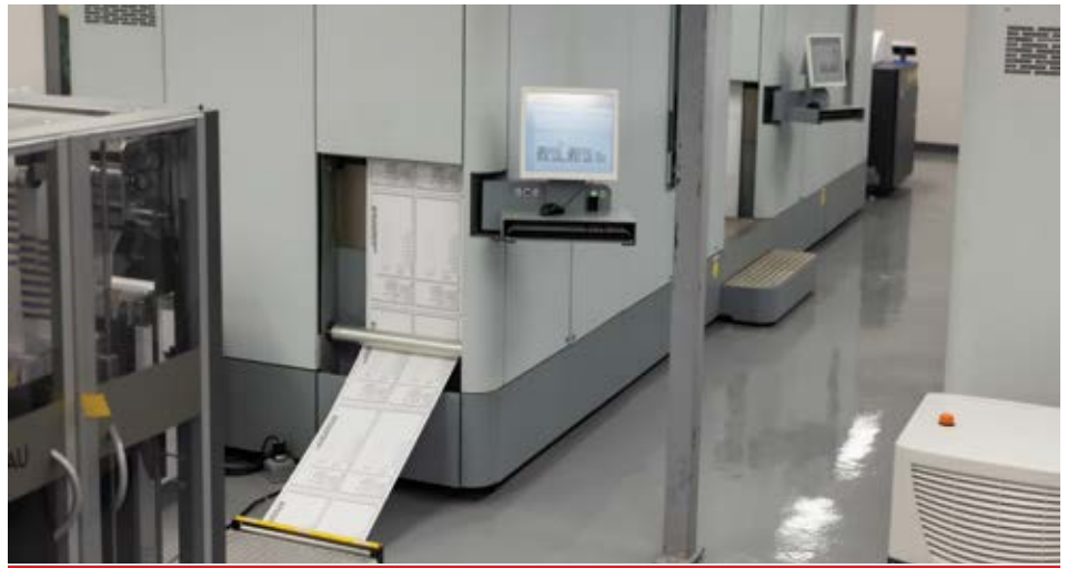
Considered the most reliable digital inkjet web press in the industry, Fort Orange Press uses two Canon ColorStream series presses, enjoying speeds of up to 417 linear feet per minute and 1,200 dpi perceived image quality.

The investments Fort Orange Press made to respond to the tremendous growth in vote-by-mail demands became an opportunity to leverage its capabilities, processes, and data management skills to expand into new directions. The company has developed valuable expertise in the data aspects of variable data mailing projects that require a fast turnaround time, highly accurate and verifiable mailing, and transparent reporting. The data handling, high-speed color variable data printing, intelligent inserting, track and trace capabilities, and real-time reporting throughout the mail production process are all highly transferrable to other large volume transactional and transpromotional print projects that are common in financial, healthcare, non-profit, and higher education vertical markets. From a positioning perspective, these expanded and refined services have not only enabled Fort Orange Press to do more business with