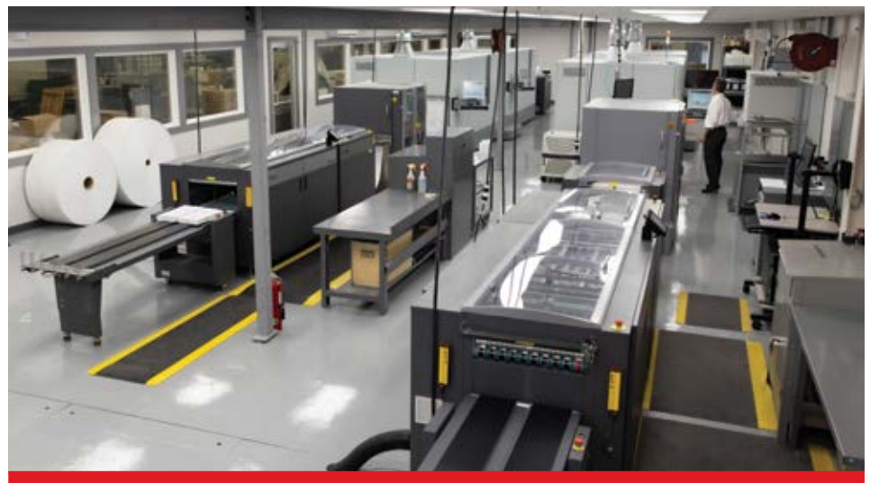
With a massive increase in the print volume and variable data complexity of absentee ballots in the 2020 election, Fort Orange Press relied heavily upon two Canon ColorStream inkjet web presses configured with inline trimming, perforating, and stacking capabilities to meet the individual time demands of its Boards of Elections customers.

of voters nationwide used vote-by-mail in the 2020 general election compared to 20.9 percent in the 2016 general election—more than a twofold increase! "Our workflows had to be absolutely airtight and perfect," Robert says. "As my dad used to say, 'The business of ballot printing is the equivalent of sending a rocket ship to the moon. You only have one shot. It has to be right on!'"