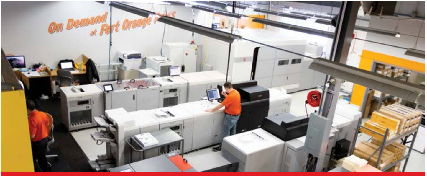
In addition to two Canon ColorStream series inkjet web presses, Fort Orange Press utilizes a Canon VarioPrint i300 full-color sheetfed inkjet press, Canon imagePRESS C10000VP full-color cutsheet toner presses, and Canon varioPRINT 6000 monochrome cutsheet toner presses.

For Fort Orange Press, a digital web solution—first toner-based and then inkjet with its first Canon ColorStream press—became necessary as volume grew.