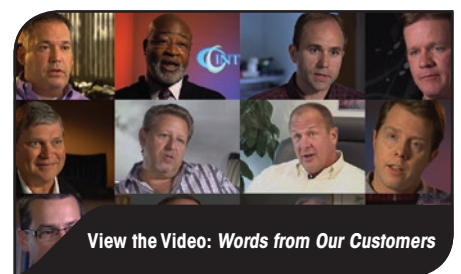
View the Video: Words from Our Customers

Learn how our 2-hour response time and 24/7 support provide rock-solid, mission-critical service levels to meet your customers' business needs.