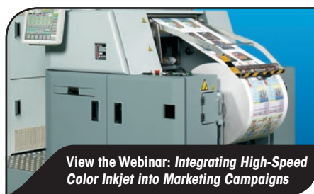
View the Webinar: Integrating High-Speed Color Inkjet into Marketing Campaigns

See how you can reap the benefits. Visit CSA.Canon.com/GA to learn more!