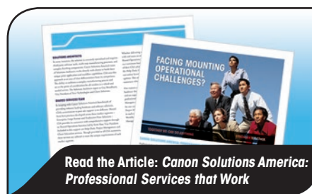
Read the Article: Canon Solutions America: Professional Services that Work

Turn inkjet technology into your next competitive advantage. Deliver more meaningful and affordable marketing campaigns for your customers.