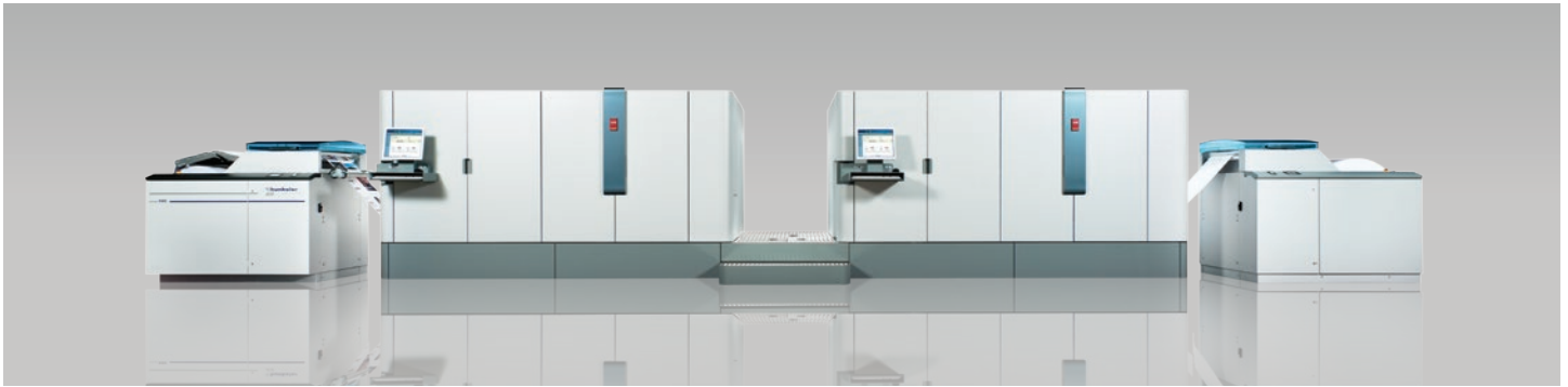
Océ COLORSTREAM® 3500

digital press. Under the development name “Niagara,” this device is designed to accelerate the printing industry’s transition from offset to high-volume digital output. Baboyian states, “This new digital press will help consolidate sheetfed monochrome and color workflows onto one production printing system.”